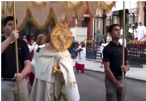
Eucharistic Procession on Corpus Christi Day On

St John the Apostle invite all parishioners, friends, family, children, wheel chair bound persons to process